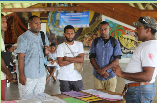
Students interact with organizers to find more information about languages.