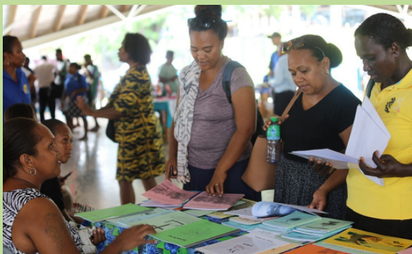
Guests visiting the information booth on displayed during International Mother Language Day