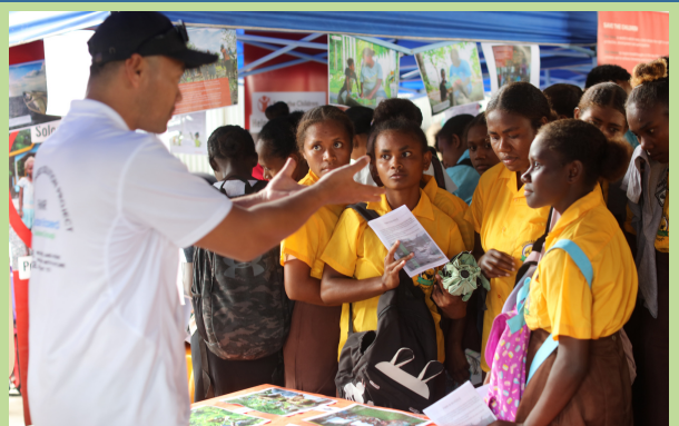
World Vision Solomon Islands officer providing education awareness to students during the International Education Day.