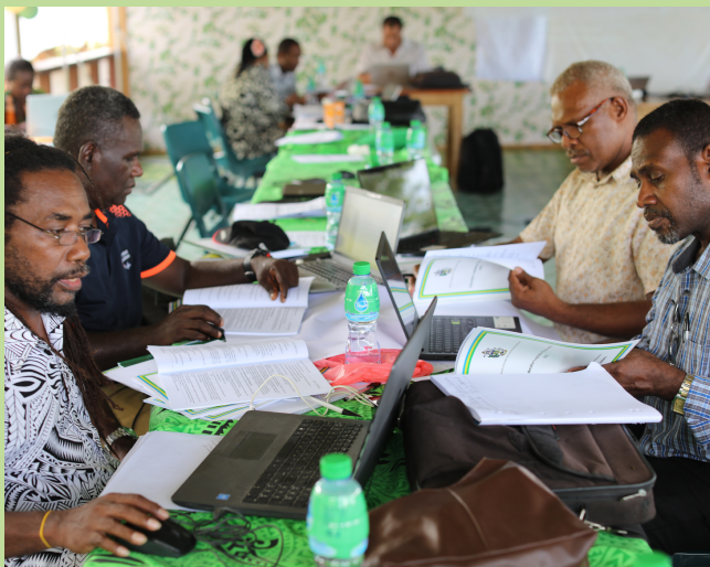
Education Providers during a week-long Bi-Annual Education Authority (now Education Provider) Forum held in Honiara from 13th- 17th November, 2023.

The Act clarifies the responsibilities of Government, provincial, and non-government education providers for staff employment and management. It emphasizes compulsory education in specific areas to ensure access to early childhood, primary, and secondary education, as determined by the Minister of Education.