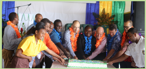
Outgoing Minister Hon. Lanelle Tanangada, official guests and student representatives cutting the International and Education Day cake.

Adding to the highlights was the farewell of five senior officers who have tendered their resignation to contest in the upcoming National General Election set for 17 April, 2024.