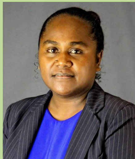
Outgoing Minister of Education Honourable Lanelle Tanangada.