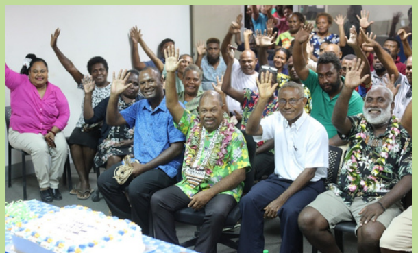
MEHRD staff bid farewell to the outgoing senior staff.